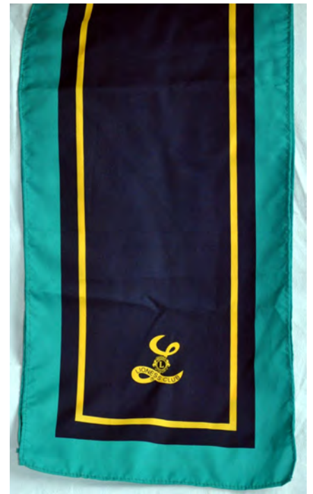
Lioness Scarf £12.50