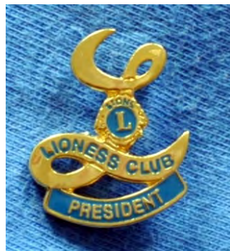
President's Pin £9.50 each