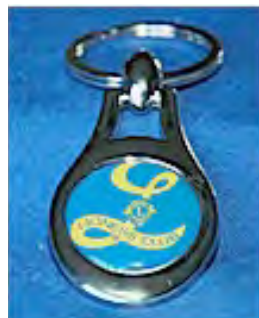
Key Ring £3.50 each