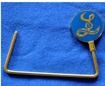
Handbag Clip £4.50 each