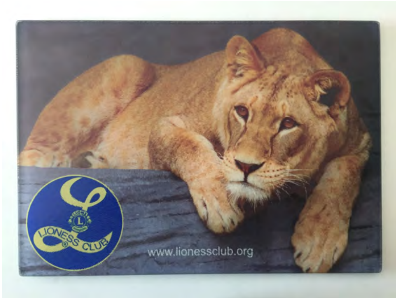
Glass Worktop Protector £10 each