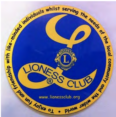
Lioness Coasters £2.50 each