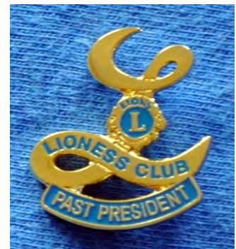
Past President's Pin £9.50 each