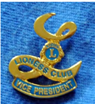
Vice President's Pin £9.50 each

Lioness New Member Pack (includes Membership Pin & Car Decal) £8.00 (£4.50 without membership pin)