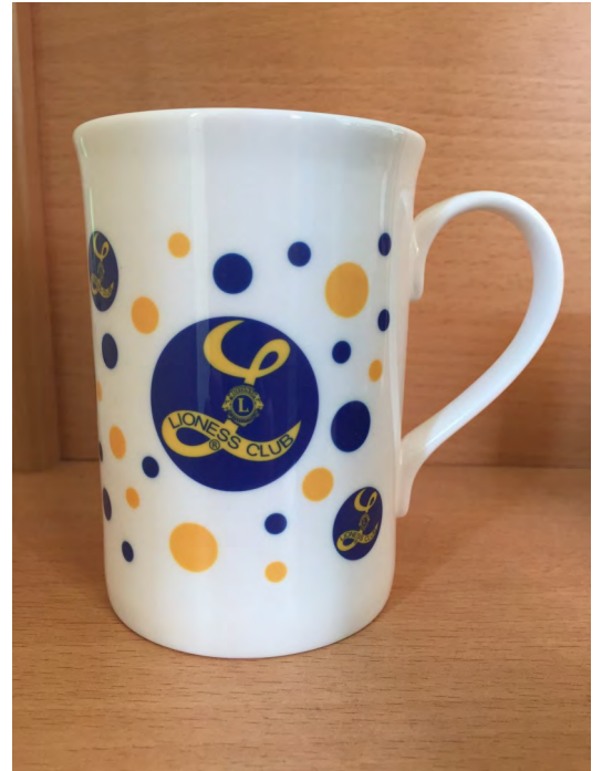
China Mug £7.50 each