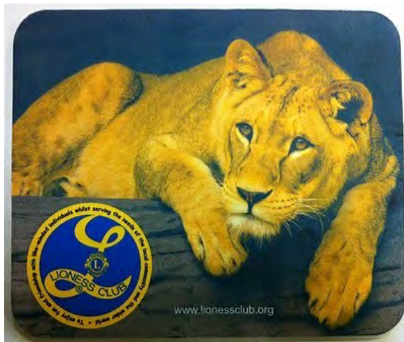
Lioness Mousemat £4.95 each

Also available yellow plastic 40th Anniversary fold away tote bags £2.50 each (a few left contact Supplies Officer)