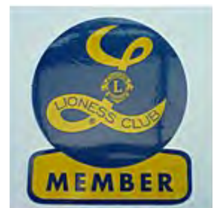
Car Decal £1.00 each