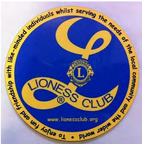
Lioness Coasters £2.50 each