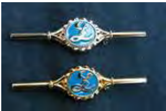
Dress Pin Gold or Silver Plated £7.50 each