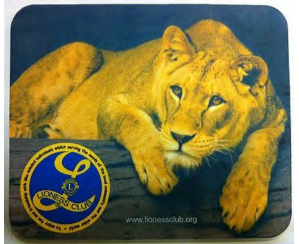
Lioness Mousemat £4.95 each