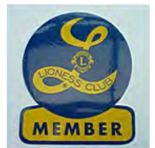
Car Decal £1.00 each