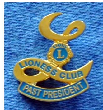
Past President's Pin £9.50 each