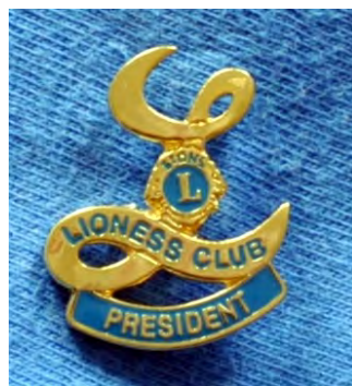
President's Pin £9.50 each