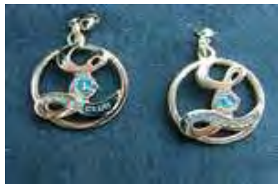
Nickel Plated Earrings £7.00 per pair