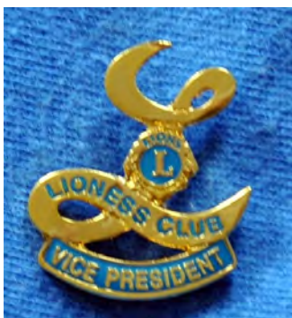
Vice President's Pin £9.50 each

Lioness New Member Pack (includes Membership Pin & Car Decal) £8.00 (£4.50 without membership pin)